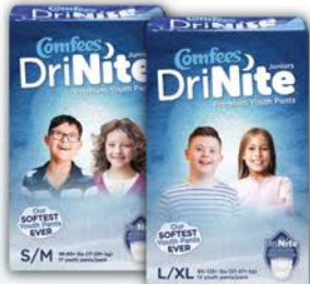
S/M 38-65lbs • L/XL 60-125 lbs

For Comfees® product information, call 800-351-1538 or visit www.mycomfees.com