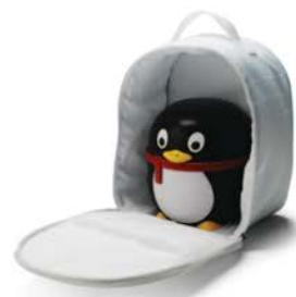
with optional igloo carrying case