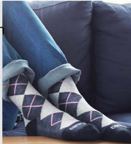
Core-Spun Patterned Compression Socks in Pink Argyle

of compression socks or stockings are approved by Texas Medicaid through most insurance for pregnancy-related swelling, along with breast pumps, maternity belts, and postpartum garments. Apply at the QR code below!