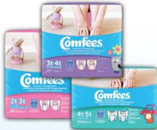
Sizes 2T to 5T