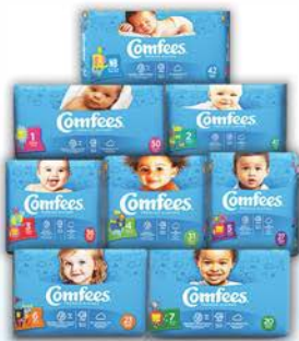
Newborn to Size 7

Have questions or need samples? Contact us.